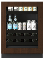
URBV424-IG01A Integrated Frame Glass