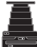
Impossible Instant Lab

Have a problem, or a question you need answered?