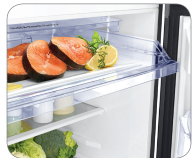
Slide & Reach Pantry