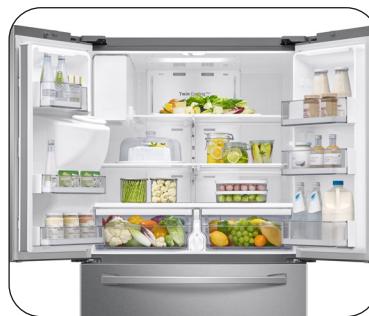
French Door Design

Fingerprint Resistant Stainless Steel (shown)