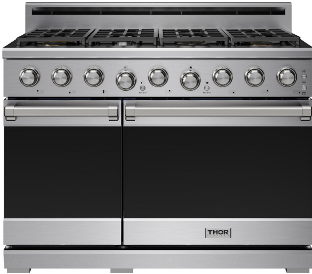
Product: 48 Inch Professional Gas Range Model Number: XRG48E