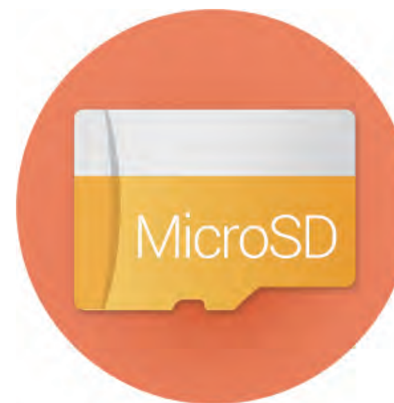
Built in SD Card

Save your recordings with flexible and secured solutions. The DB1 comes with a built-in MicroSD card slot that can store up to 128 GB recordings. You can also save your images to EZVIZ Cloud and EZVIZ NVRs for additional back-up. (EZVIZ cloud storage service is only available in the US and UK.)