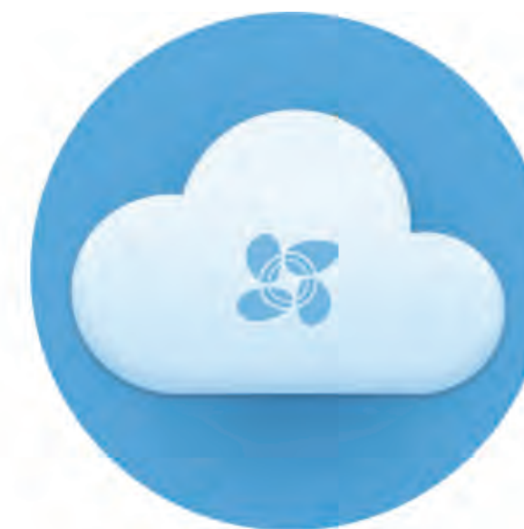
Encrypted Cloud Storage