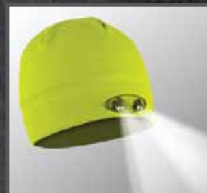
ITEM # WB-5529 HI-VIS