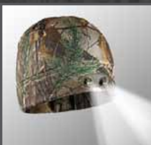
ITEM # WB-4539 REALTREE® XTRA