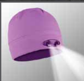
ITEM # WB-5628 RADIANT ORCHID