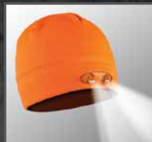
ITEM # WB-4546 BLAZE