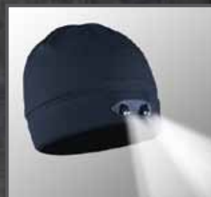
ITEM # WB-4737 NAVY