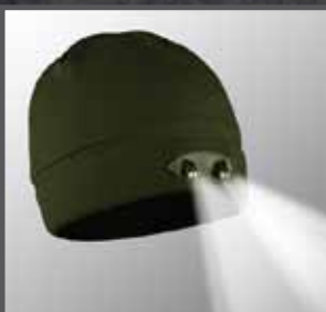
ITEM # WB-5505 OLIVE