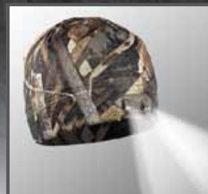
ITEM # WB-5659 MAX 5