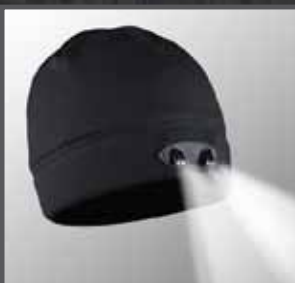
ITEM # WB-4553 BLACK