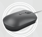
Lenovo 540 USB-C Wired Mouse