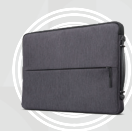
Lenovo Urban Sleeve 14"

* Example of Lenovo catalogue naming convention