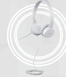
Lenovo 100 Stereo Analog Headset