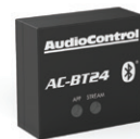
Optional AC-BT24 Bluetooth® Streamer & Programmer