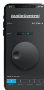
DM CONTROL APP (iOS AND ANDROID)