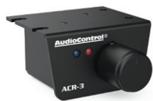
Optional ACR-3 dash remote for programmable level control.