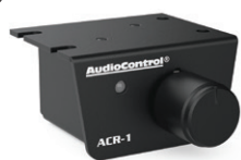
Optional ACR-1 dash remote for subwoofer level control.