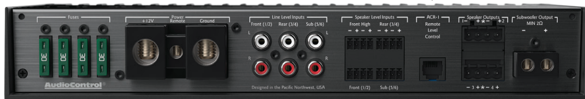
LC-5.1300 | FIVE CHANNEL AMPLIFIER