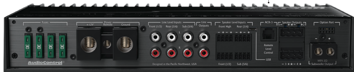
D-5.1300 | FIVE CHANNEL DSP MATRIX AMPLIFIER

AudioControl's multi-platform DM Smart DSP app allows complete control over all tuning features of the D-5.1300 including 30 bands of EQ, signal delay, phase correction, AccuBASS®, GTO™ Signal Sense, MILC™ Clip Detection, plus integrated input and output RTAs. Access DM Smart DSP from your phone or tablet with the optional AC-BT24 Bluetooth® Streamer & Programmer and use the all new DM Control app for easy access to level adjustments and preset recall.