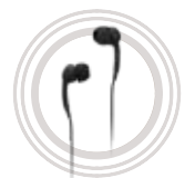
Lenovo 100 In-Ear Headphone