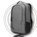
Lenovo 17" Laptop Casual Backpack B730