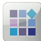
NAS App Center