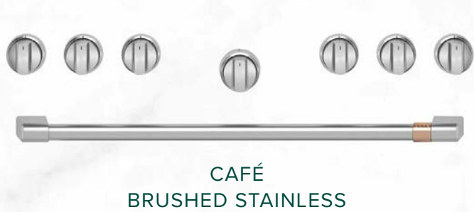
KOHLER PURIST SEMI-PROFESSIONAL KITCHEN FAUCET VIBRANT STAINLESS

Café continues to set trends with curated finishes inspired by the runway. Now Café joins design forces with iconic brand KOHLER to bring complementary hardware finishes to the kitchen space, so you can reflect your unique style. Together these brands are bold thought leaders in design that power self-expression.