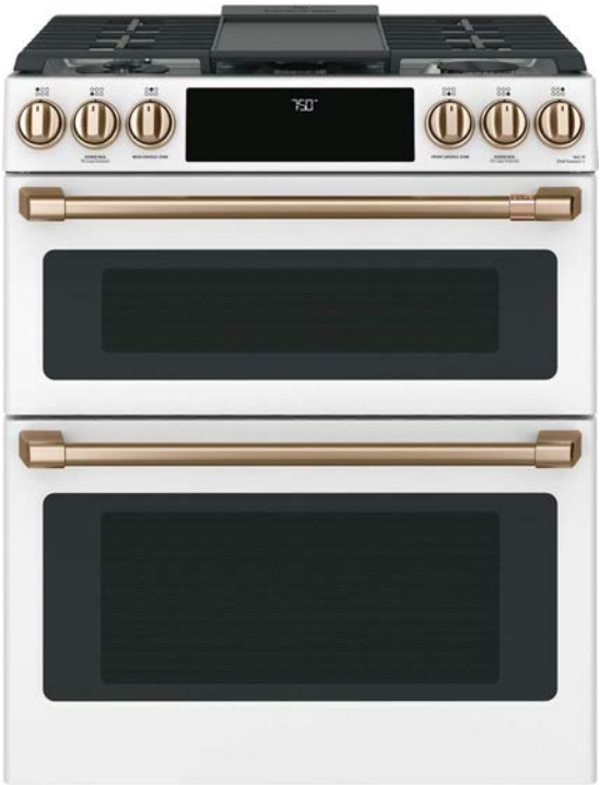
30" Smart Slide-In, Front-Control Gas Double-Oven Range with Convection CGS750P4MW2