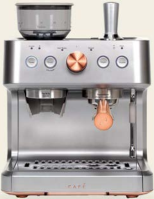
BELLISSIMO Semi Automatic Espresso Machine + Frother C7CESAS2RS3 STATEMENT DRINKS MADE BY YOU