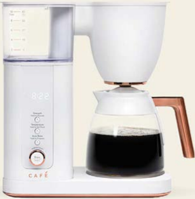
Specialty Drip Coffee Maker with Glass Carafe C7CDABS4RW3 FOUR SCA CERTIFIED BREW MODES