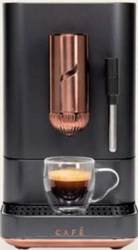
AFFETTO Automatic Espresso Machine + Frother C7CEBBS3RD3 EXTRA STYLE, EXTRA CAFFEINE