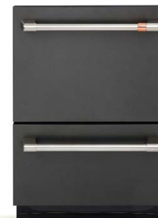
24" Double Drawer Dishwasher CDD420P3TD1