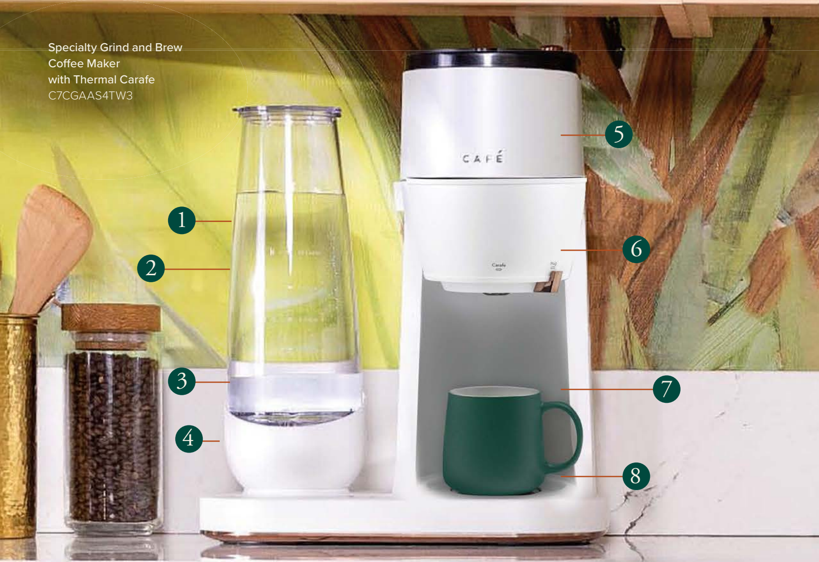
Specialty Grind and Brew Coffee Maker with Thermal Carafe C7CGAAS4TW3