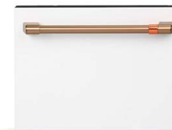
Smart Single Drawer Dishwasher CDD220P2WS1