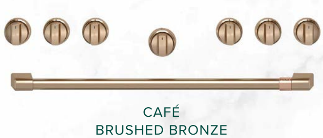
KOHLER VIBRANT KITCHEN FAUCET BRUSHED BRONZE