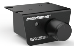
ACR-1 Remote Level Control Included