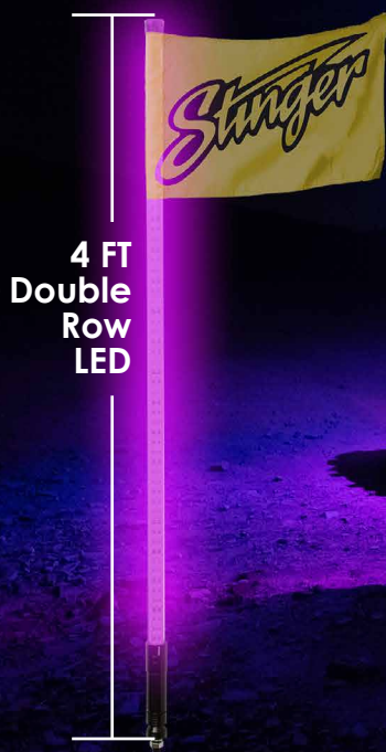
SPXWPRGB4 264 LEDs