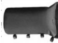
Counterweight bag x 4 pc