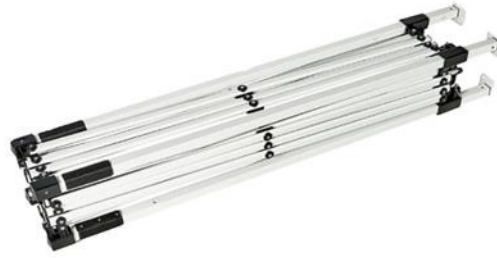
Folding Steel Frame x 1 pc