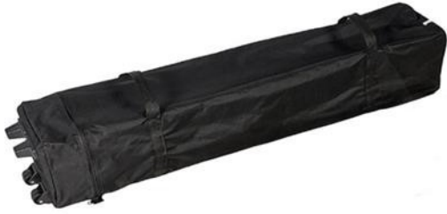
Outer carry bag x 1 pc