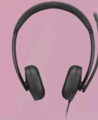
Lenovo Wired VoIP Headset 5000 4XD1R88995