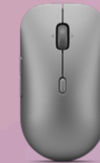
Lenovo Wireless Multi-Mode Pro Plus Mouse 6050 (Luna Grey) 4Y51S61878

Please click here to view the full list of accessories.