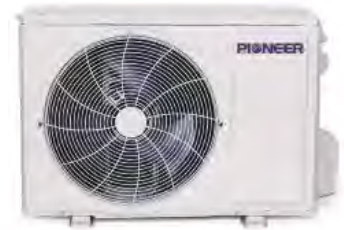
Outdoor Condensing Unit