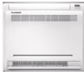
Floor-Mounted Indoor Unit

Heating (17°F) = 9,000 BTU / Heating (5°F) = 8,900 BTU / COP2 (5°F) = 2.5 W/W