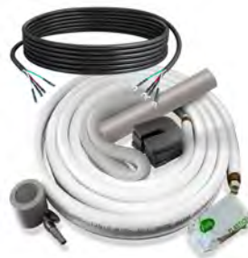
User-Selected Installation Kit