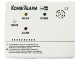
combi sensor anesthesia/ gas detector

The arming LED shows you the switching status of the system at any time. Thus, you know whether the system is armed or disarmed.