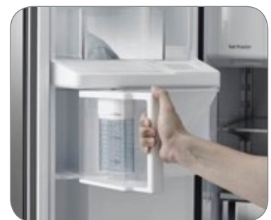
Auto Water Fill