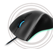
Lenovo Legion M500 RGB Gaming Mouse