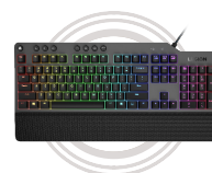
Legion K500 Gaming Keyboard