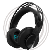
Lenovo Legion H300 Gaming Headset