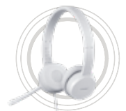
Lenovo 110 USB Stereo Headset