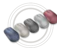
Lenovo 530 Wireless Mouse