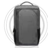
Lenovo 15.6" Laptop Urban Backpack B530