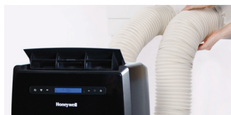
Quick and Easy Installation - Dual Hose for Faster Cooling