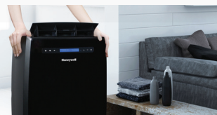
Easy to Maintain, Easy to Store