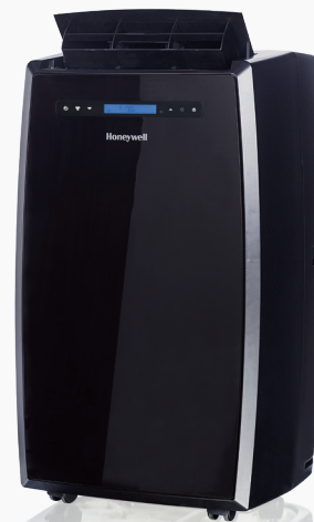
Product Dimensions (in): 18.1 (L) 15.2 (W) 29.3 (H) Net Weight: 75.6 lbs / 34.3 kg

Unlike a fixed AC, this unit requires no permanent installation and four caster wheels provide easy mobility between areas. Plus, the auto-evaporation system allows for hours of continuous operation with no water to drain or no bucket to empty. This model comes with everything needed including two flexible exhaust hoses and an easy-to-install window venting kit. The window vent can be removed when the unit is not in use.