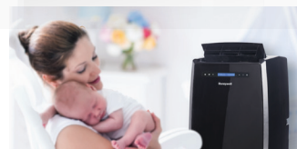
Quiet Operation - Between 51 to 53 dbA