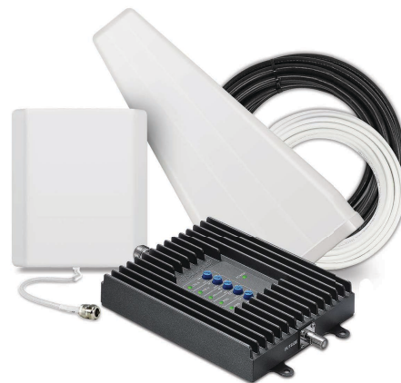
Shown: Fusion4Home Yagi/Panel signal booster kit

Kit includes: High-performance Fusion4Home booster, high-gain directional Yagi antenna with mounting hardware, 50 ft RG-11 low-loss outdoor cable, high-gain wall mount panel antenna, 20 ft of low-loss indoor cable, AC power supply, and quick guide.