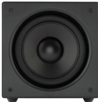
MS10SUB SUBWOOFER BBY SKU 6360974 TYLER SKU MS10SUB

The Sonance MS10SUB is built to deliver powerful, accurate, low-distortion, bass to any room. The subwoofer features an ultra-long throw driver that deepens the bass notes for a more defined sound. The MS10SUB is the perfect solution to immerse your space with breathtaking bass. The MS10SUB is offered exclusively at Best Buy and BestBuy.com.