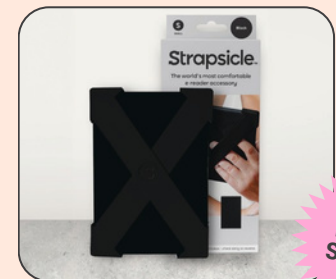
BLACK WS: $12.95 RRP: $25.95