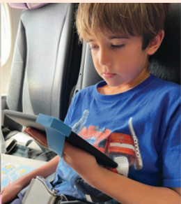
Easier to hold.