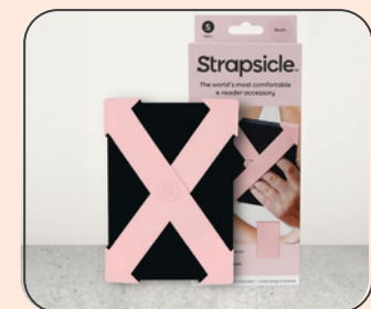
BLUSH WS: $12.95 RRP: $25.95