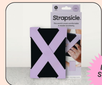
LILAC WS: $12.95 RRP: $25.95