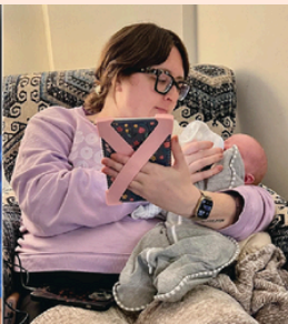
Multitasking made easy.