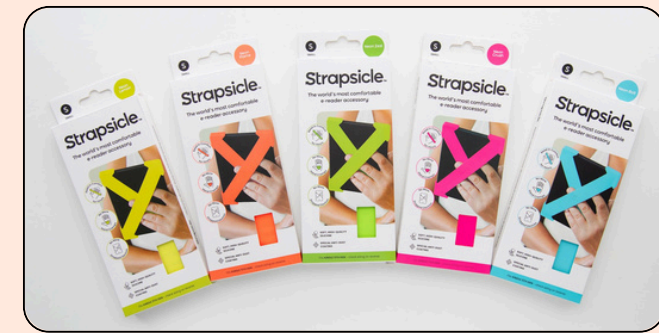
THE NEON RANGE WS: $12.95 RRP: $25.95