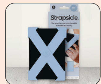
BONDI BLUE WS: $12.95 RRP: $25.95