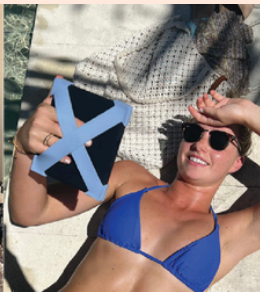
No more drops.