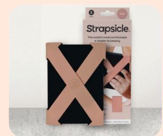
CARAMEL WS: $12.95 RRP: $25.95