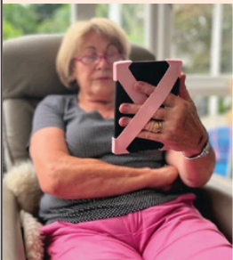
Less hand strain.