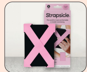
CANDY PINK WS: $12.95 RRP: $25.95