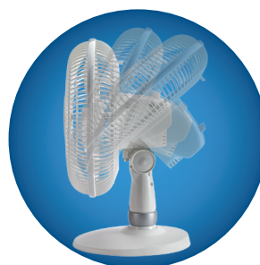
Full Range Tilt-Back Feature