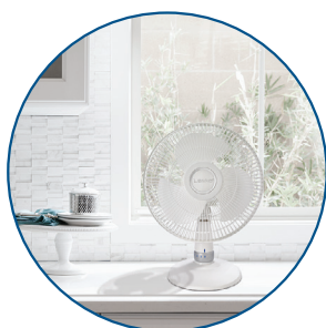
3 Quiet Speeds