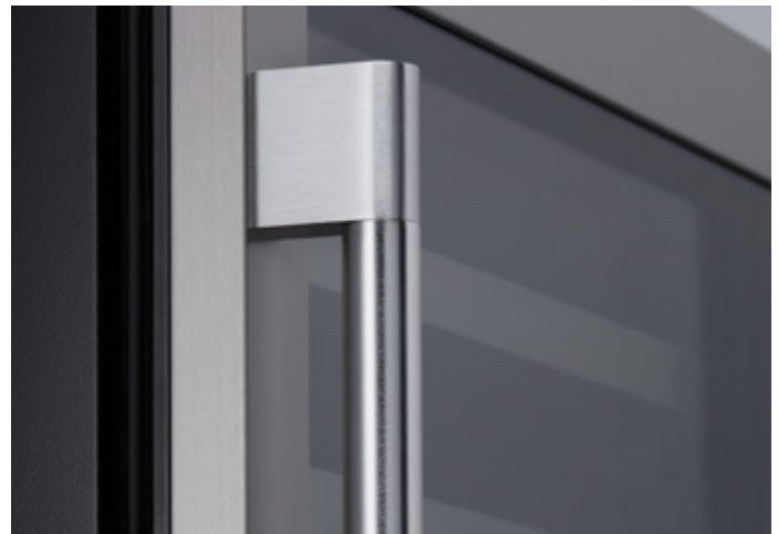
Optional Pro Handle