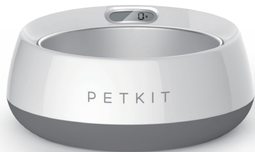
304 Stainless Steel

This FRESH METAL SMART BOWL measures and calculates the accuracy of the amount of food that your pets are consuming. Simply download the PETKIT App and start to get your daily feeding suggestions.