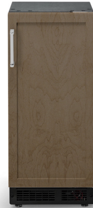
FNIU515D (shown with custom panel)