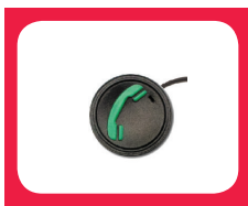
Control Button with Mic (B) Used to control your audio and calls