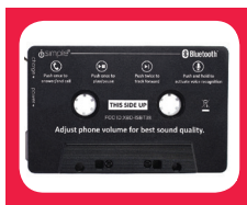
Bluetooth Cassette (A) Inserts into your car radio's cassette player

Be careful when removing all items from the packaging tray. Take care not to tug or pull on cables.