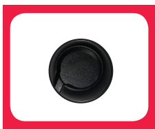
Button Dash-Mount (C) Adheres to your dash. Holds control button