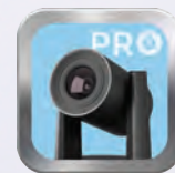
PTZ Control Pro 2

Click here to see our full list of Integration Partners