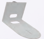
PT-PM-3-WH For 30X Models