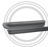
Lenovo Yoga Pen Gen 2 with Case