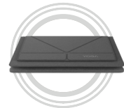
Lenovo Yoga Tote Sleeve