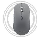
Lenovo Yoga Bluetooth Silent Mouse