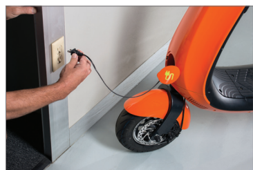
Patented on-board charger with retractable cord & plug