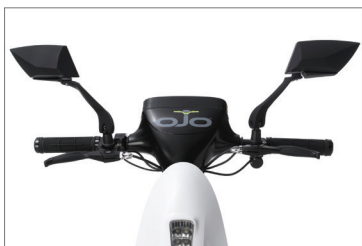
Rearview mirrors - sold separately Set of 2 Mirrors: Model #MRI00