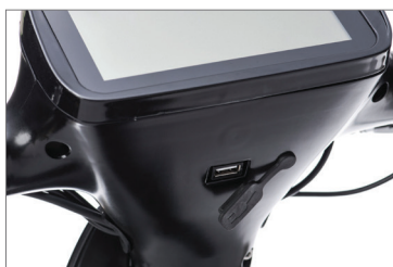
Built-in USB port for phone charging