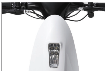
4-bulb LED headlight