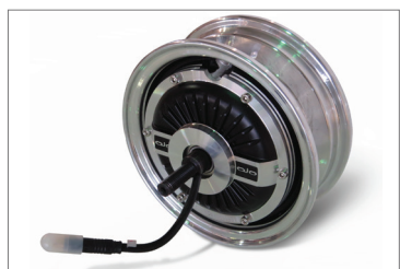
Patented 500 watt HyperGear® hub motor