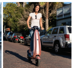
20 mph top speed