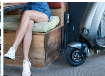
Patented on-board charger