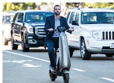
Bike lane friendly (check local laws)

The Ojo is equipped with an exclusive non-glare interactive capacitive display screen that puts all operational content at your fingertips. Adjust speed modes, turn the headlight/tail light on and off, sync your smart phone with Bluetooth speakers, adjust volume, and view MPH, battery level, trip time, trip distance and odometer.