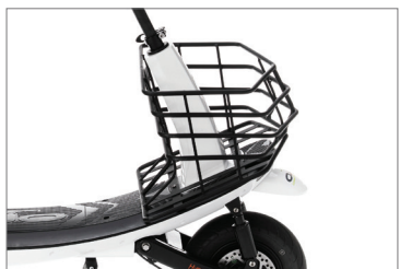
Basket - sold separately Model #BSK100