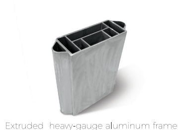
Extruded heavy-gauge aluminum frame