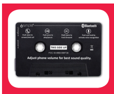
Cassette Adapter (A) Inserts into your car radio's cassette player

Be careful when removing all items from the packaging tray. Take care not to tug or pull on cables.