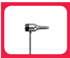
Control Button with Mic (B) Used to control your audio and calls

Tip! If the cassette adapter cannot be loaded in "This Side Up", you can insert the cassette adapter upside down, just make sure you press the A/B button on your car radio.