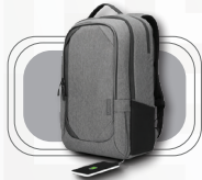
Lenovo 17" Laptop Casual Backpack B730