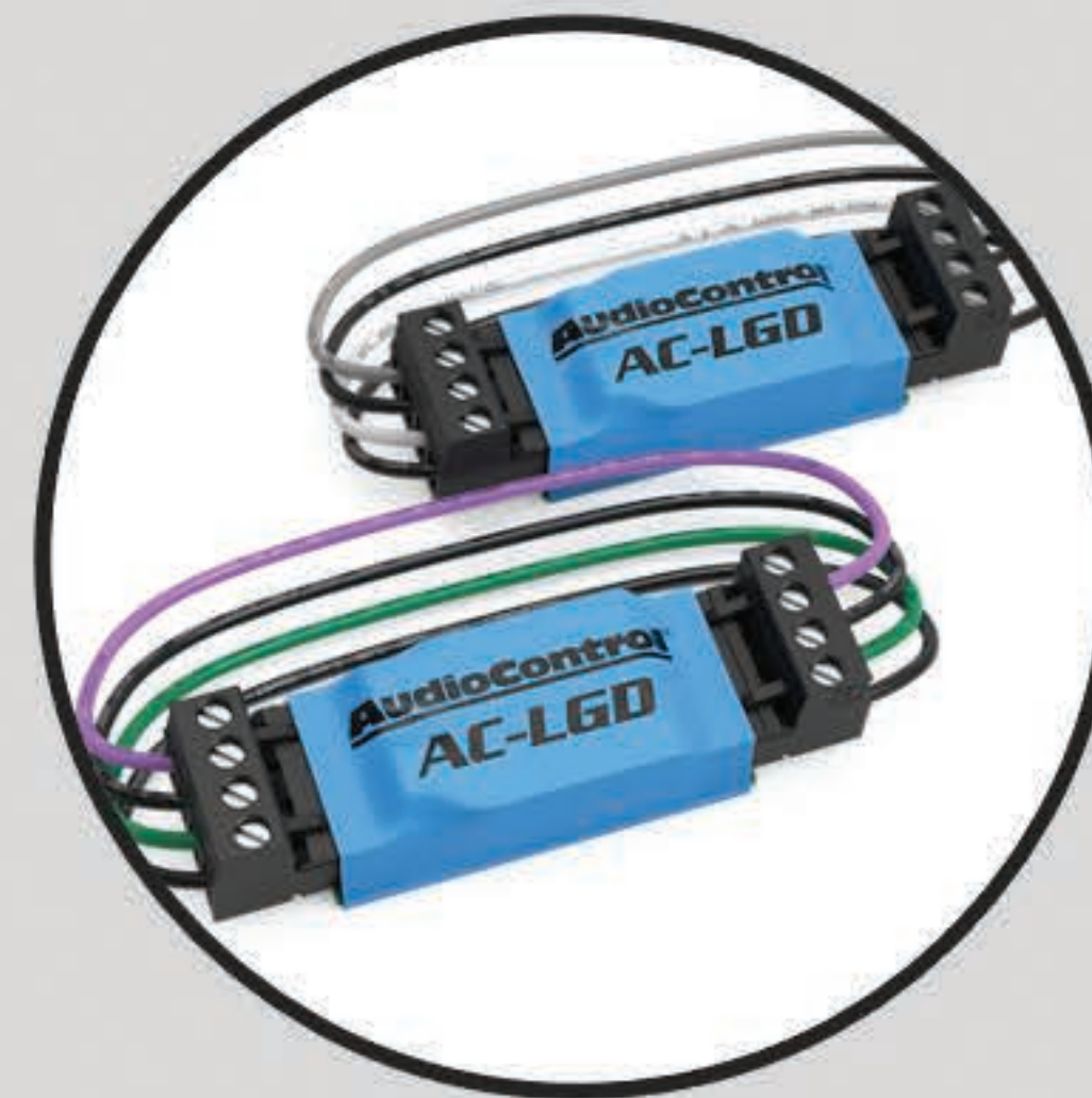
AC-LGD for 2005-2015 vehicles ALL MAKES/MODELS