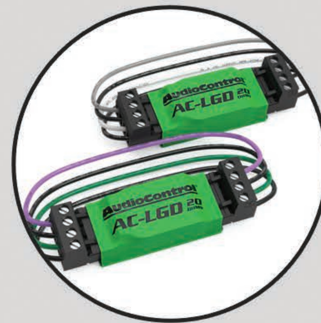
AC-LGD20 for 2018+ vehicles W/O AMPLIFIED OEM systems