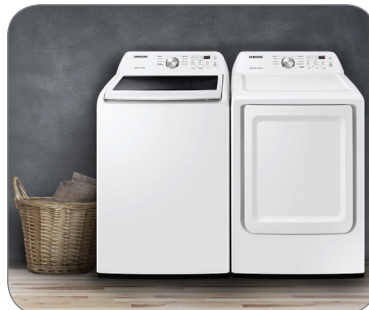
Vibration Reduction Technology+