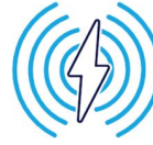
Wireless Charging Compatible