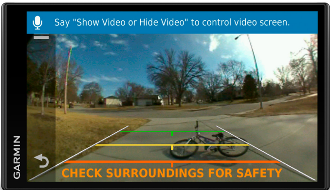
Portable navigator sold separately.

See what's behind your vehicle with a BC 40 wireless backup camera. It wirelessly pairs with a compatible Garmin navigator enabled with Wi-Fi® connectivity to see the backup camera view on the navigation display, and it installs quickly and easily.