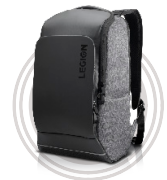
Lenovo Legion 15.6" Recon Gaming Backpack