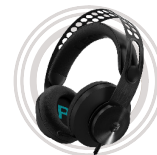
Legion H300 Stereo Gaming Headset