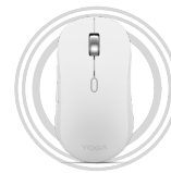
Lenovo Yoga Bluetooth Silent Mouse