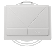
Lenovo Yoga Tote Sleeve