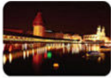
With ASCR 50,000,000:1