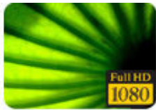
With Full HD 1080p HDMI Support