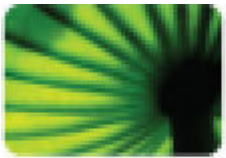
Without Full HD

Enter a spectacular world of colors with Full HD 1080p (1920x1080) support and HDMI port.