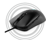
Lenovo Legion M300 Mouse