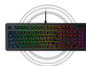
Lenovo Legion K300 Keyboard