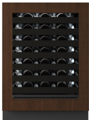
URWC424-IG01A Integrated Frame Glass