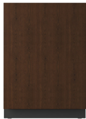
URWC424-IS01A Integrated Solid