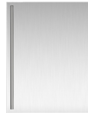
ULASBPGLOSS24 (Frame) ULASBPSOLID24 (Solid) Stainless Steel Door Wrap with Classic Bar Pull