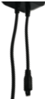
IR Receiver (on adapter housing)