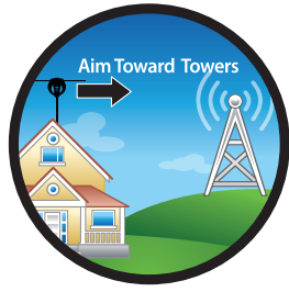
For Tower Locations: antennapoint.com