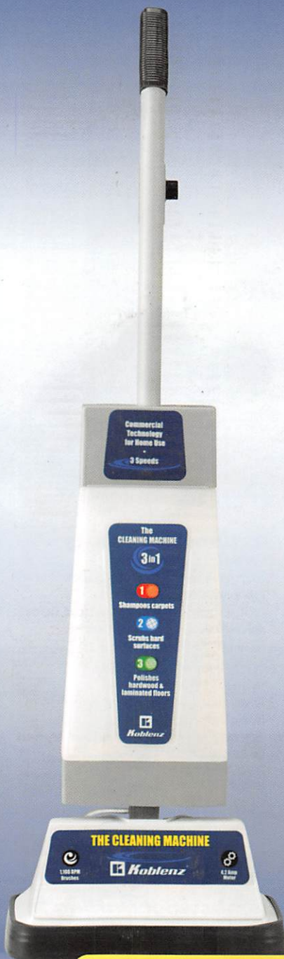
Model: P-820 B