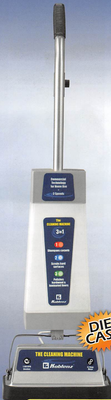
Model: P-2500 B