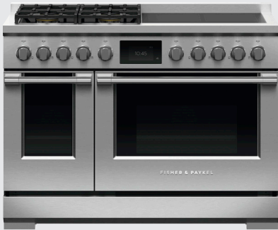
A FREESTANDING RANGE 30", 36" OR 48"