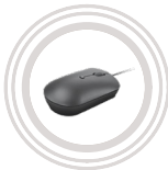
Lenovo 540 USB-C Wired Mouse