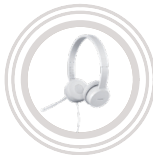
Lenovo 100 Stereo Analog Headset