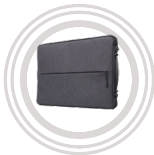
Lenovo Urban Sleeve 14"